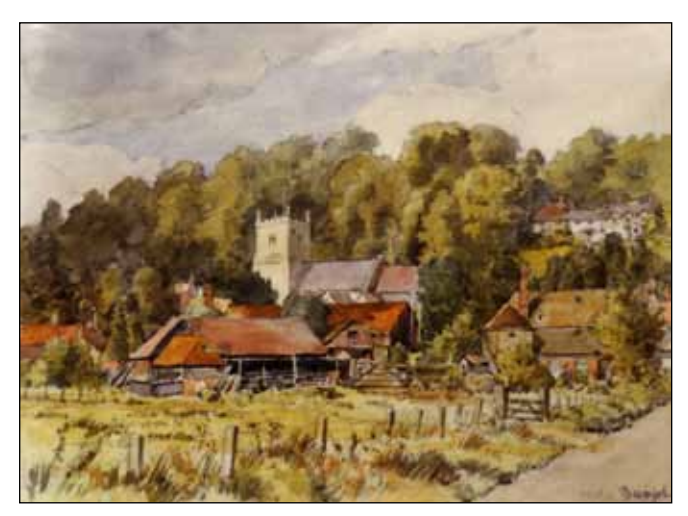
Church Hill and the Old Byre, painting by Hilda Burford

The land which later became East Knoyle parish was first recorded by name and some of its boundaries set out during the 10th century. 'Knoyle' derives from the Old English word which has become 'knuckle', and accurately describes the distant view of the prominent greensand ridge which runs east—west across the parish and divides the flat clay pasturelands in the south from the high chalk downland in the north. Evidence of human occupation in the area has been recorded from the Mesolithic period onwards, including Bronze Age barrows on the downland, an Iron Age settlement site north of East Knoyle village, and the course of a Roman road crossing the later parish.