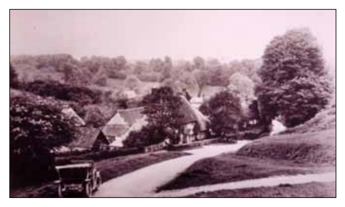
Milton, c. 1917

A large and important estate by the time of the Norman conquest, East Knoyle then covered a slightly greater area than that of the modern