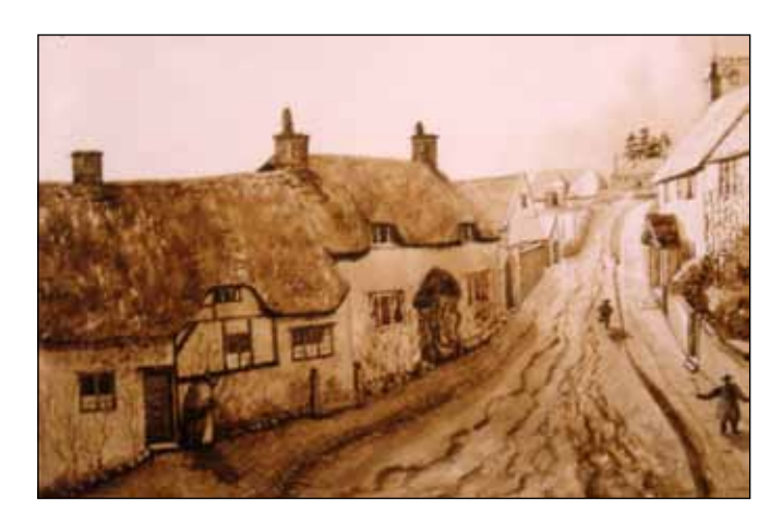
Church Road, 1845, painting by Jane Bouverie

and extending beneath the tree-covered greensand ridge some 200 metres east and west as far as Knoyle House Ground, site of a mansion of the Seymour family demolished in 1954; and Knoyle Place, the former rectory. The church retains architecture of many periods from the 11th century onwards, and immediately to its west stood the home farm of the manor, which belonged from about 1180 to the bishops of Winchester. Most of the farm buildings have disappeared, including a tithe barn which was demolished after the present road was built through the farmyard in 1856; but the main room of the medieval farmhouse survives as part of the present village hall. A school of exotic design was built nearby in 1872 and survives, although closed in 1984. A large oval hunting park, partly wooded, was laid out to the south of the church and farm in the middle ages; its park pale survives in places and defines the rear boundaries of properties along the village street. A second area of parkland was created north of the ridge when Clouds House,